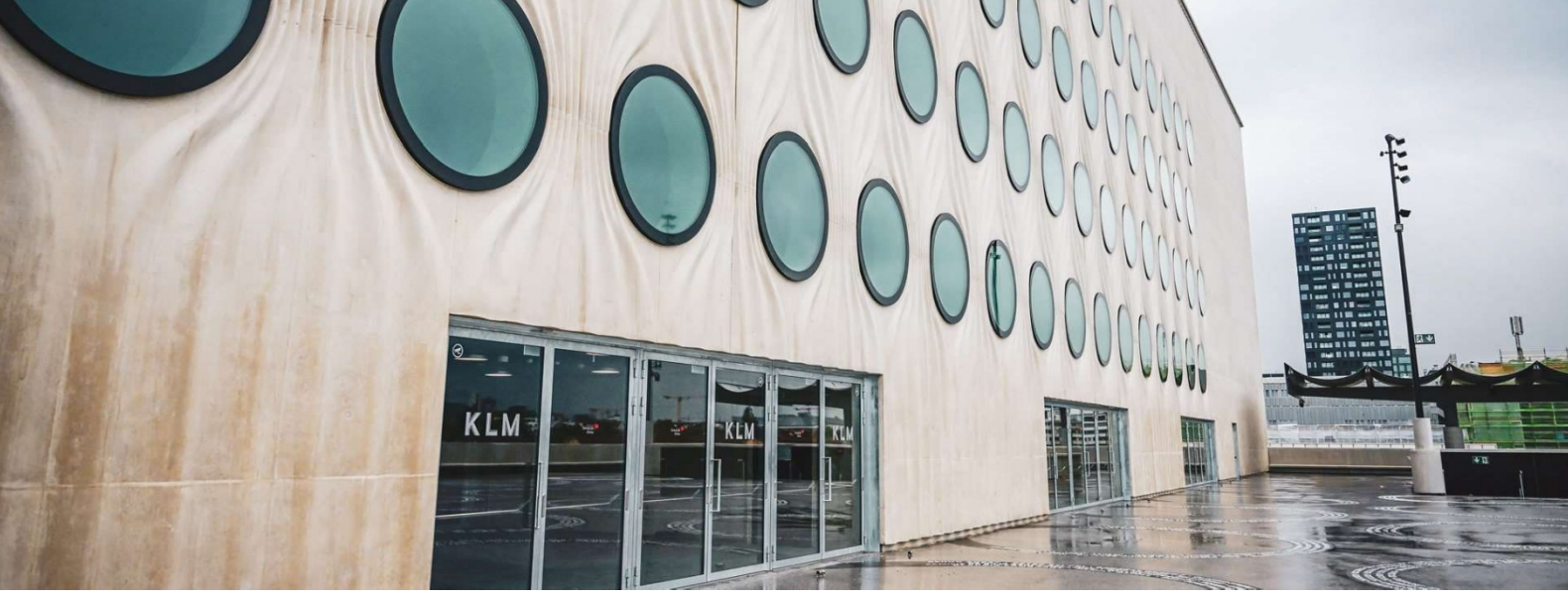
Reference report Surber Metallbau AG - Baggenstos